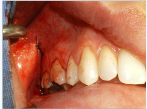
Figure 7: A single stitche is normally enough to close the incision.