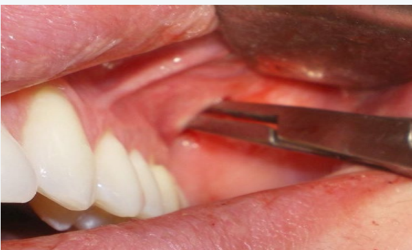
Figure 2B: Hemostat lightly opened inserted through the incision into left and right side.