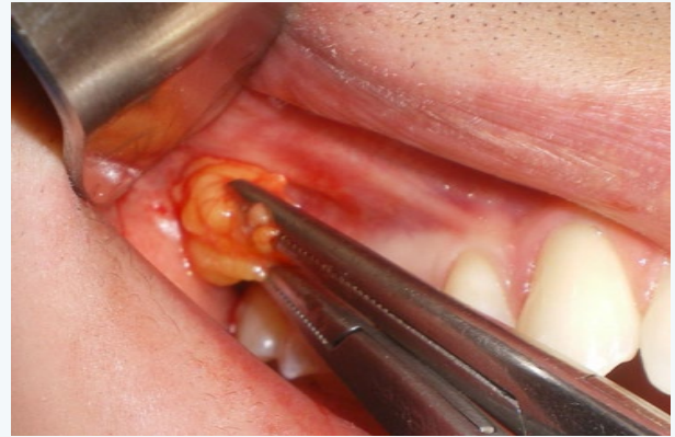
Figure 3: Small hemostats are intercalated during the fat pad traction.