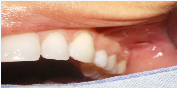
Figure 1: Small incision performed at the base of the zygomatic buttress.

local anesthesia to suture. There are no formal indications for sending the specimens for histo pathological examination unless any different aspect of the structure is macroscopically observed as far as color and/or caliber of blood vessels is concerned. Pain medication is regularly prescribed along with intense bilateral cryotherapy in the areas during 24 to 48 hours. Prophylactic antibiotic can be prescribed and a five to seven days antibiotic prescription is a good option when the fat pad is not removed in just one piece. Very rare problems or accidents during the surgical procedure can occur and are resumed as lesion to the Stensen's duct and its aperture and injury to the buccal branch of the Facial nerve resulting in Stensen's duct injuries, which are manifested with sialoceles or salivary fistulas [3], and temporary numbness of the long buccal nerve. The results can effectively be seen after four to six months when the soft tissue edema is definitely resorbed away (Figures 8A-8C, Figures 9A-9C).