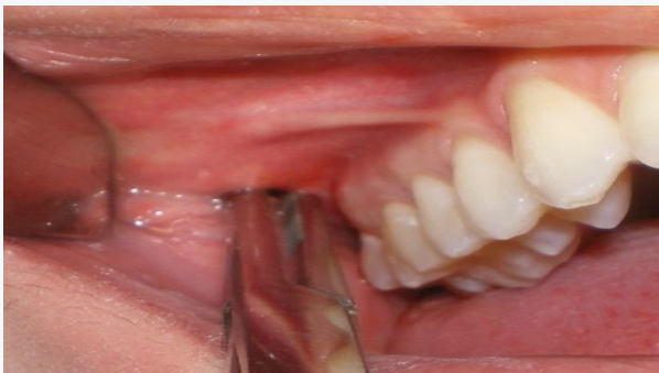
Figure 2A: Hemostat lightly opened inserted through the incision into left and right side.