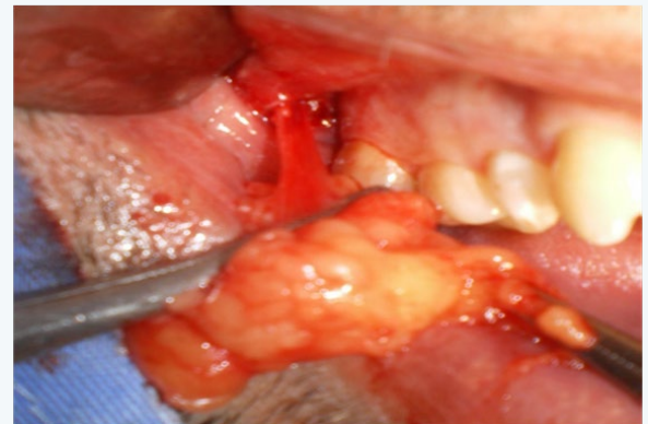
Figure 5: The fat pad pedicle under intense traction to be scised.