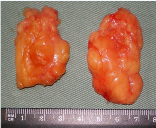
Figure 6: The right and left fat pads exposed after being entirely removed as one piece structure.