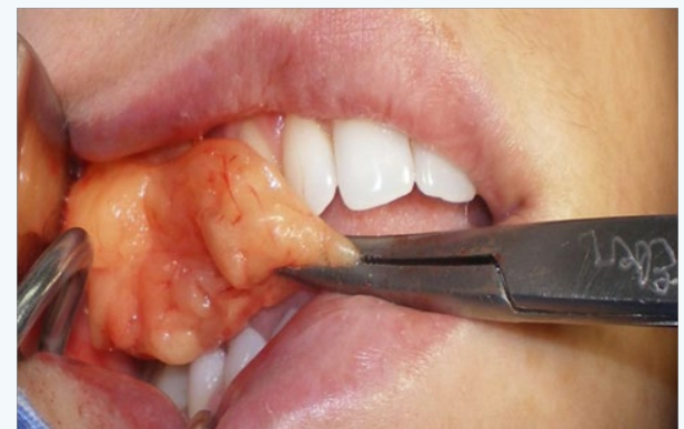
Figure 4: The whole fat pad is pulled out and exposed to the oral cavity.