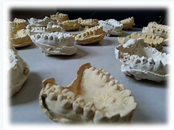
Figure 2: Stone cast for volunteers.

Poured with Type IV dental stone (Figure 2).