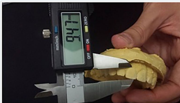
Figure 6: Measuring length of incisor tooth.