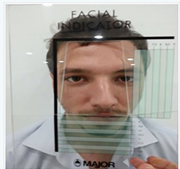
Figure 3: Position of the facial indicator.