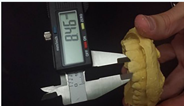
Figure 5: Measuring width of incisor tooth.