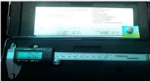
Figure 4: Digital caliper used in this project.

Measurements of widths and heights of the maxillary right central incisors were made on the casts using a precise Digital Calliper read to the nearest 0.01 mm precision. All the measurements were obtained by one person [6] (Figures 4-6).