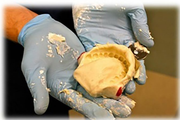
Figure 1: Impression taken for volunteer

Impressions are negative reproductions of dental structures. Irreversible hydrocolloid impressions materials were used to obtain an impression of the maxillary arches with stock trays (Figure 1).