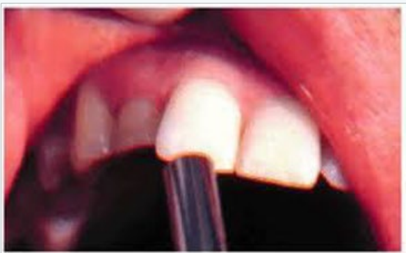
Figure 1: Percussion

Percussion: Percussion of tooth initially with fingers (low intensity) and then later with increasing intensity using the handle of an instrument is undertaken to evaluate the status of the periodontium surrounding the tooth. A positive response differing from adjacent tooth, usually indicates the presence of periodontitis. When periodontitis occurs unrelated to periodontal lesions, it usually is a sequelae to pulpal necrosis. When apical periodontitis is present as a sequelae to periodontal lesions, the pulp is usually vital. While percussing a particular tooth, a more valid response can be obtained if at the same time, patient's body movement, reflex pain reactions or even an unspoken response is observed (Figure 1).