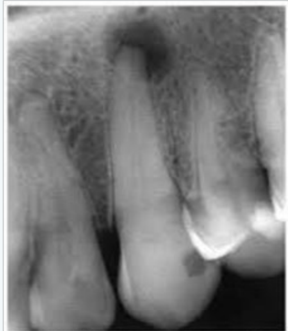
FIGURE 2 - Maxillary canine with obliteration of pulp chamber by calcific metamorphosis of the pulp. It is noteworthy that after a few years chronic periapical lesion was detected. It is found in approximately a quarter of cases between 2 and 22 years of monitoring.