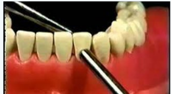
Figure 2: Mobility

Radiography: Radiographs contain information on the presence of