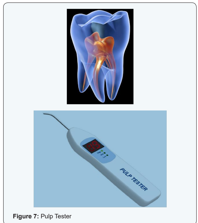
Figure 7: Pulp Tester

Electric Pulp Testing: The electric pulp tester uses a nerve stimulation to determine the presence of vitality. The objective is to stimulate a pulpal response by subjecting the tooth to an increasing degree of electric current. A +ve response is an indication of vitality whereas a -ve response is indicative of pulpal necrosis (Figure 7).