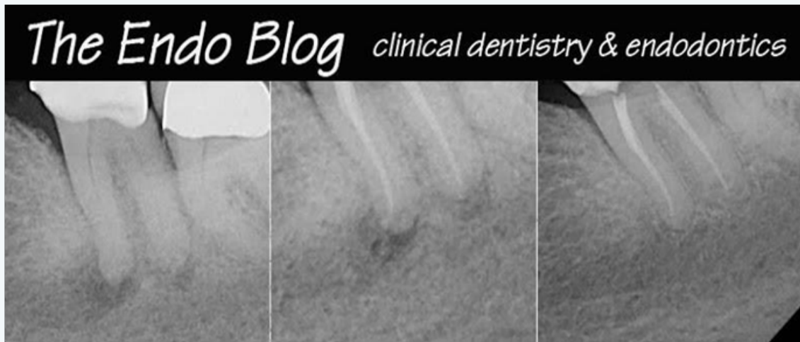
Figure 5: Periapical X-ray