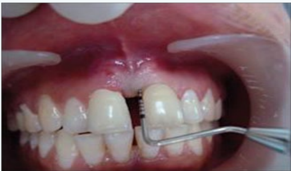
Figure 3: Periodontal Probe