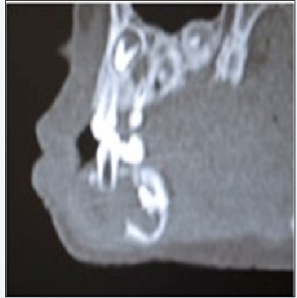
Figure 3: CT scan sagittal view.