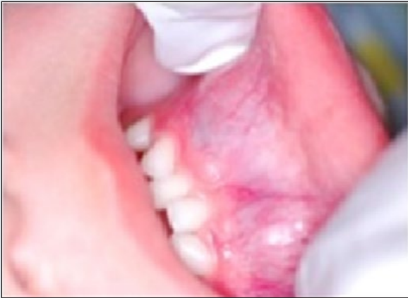
Figure 1: Anterior mandibular swelling.

infusion (Figure 4). Initially a fine needle aspiration (FNA) was performed and cytological examination showed features of a small round blue cell tumor with features suggestive of an ES/ Primitive neuroectodermal tumor (PNET). An excisional biopsy was performed the histologic examination showed sheets of small round blue cells with scant cytoplasm separated with some fibrous strands (Figure 5). Mitotic and apoptic figures were conspicuous. The tumor cells appeared to destroy bony septae. Neoplastic cells were strongly and diffusely reactive with CD99 and FLI-1 immuno histochemistry. NSE, CD45, Myogenin, and MyoD1 were non-reactive ruling out the possibility of a tumor of skeletal, neural or lymphoid origin. Fluorescent in situ hybridization (FISH) studies for ES rearrangements were performed in the Department of Pathology & Laboratory Medicine at BC Children's Hospital and showed the EWSR1 locus located on chromosome 22 q12. There was no evidence of a rearrangement involving FKHR (FOXO1) (which is frequently rearranged in alveolar rhabdomyosarcoma).