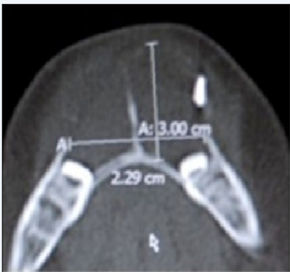
Figure 2: CT scan axial view.