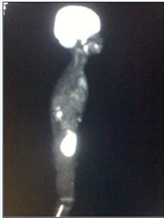
Figure 6: PET scan six months after completion of treatment.

The case was reviewed at the Cancer Care Center tumor board and the decision was made to start with chemo radiation therapy. The patient received 5580 cGY of radiation in 31 fractions and underwent chemotherapy with Cyclo phosphamide, Vincristine and Adriamycin for twenty-five weeks, with Ifosfamide and Etoposide for twenty-three weeks. Follow up with PET scan six months after completion of treatment showed no significant hypermetabolism in the region of the patient's primary tumor in the anterior mandible (Figure 6).