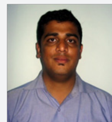
Figure 1a: Pre treatment extra oral-Frontal

A 29 year old male presented with forward placement of the maxillary and mandibular incisors, and anterior open bite with forward tongue posture. Extra oral assessment: The patient had a leptoprosopic face, mildly concave profile, mild anterior