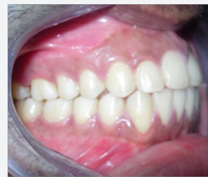
Figure 4e: Post treatment intraoral-Right.