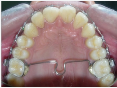
Figure 2: Transpalatal arch with loop made of 0.9mm stainless steel arch wire.

surfaces of the maxillary incisors to restrain the tongue and posture it in its normal position.