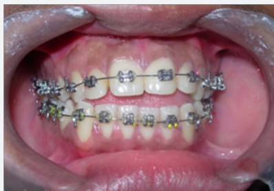
Figure 3: Initial aligning and leveling – 0.014 inch nickel titanium arch wires.