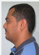
Figure 4b: Post treatment extraoral-Profile