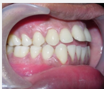
Figure 1e: Pre treatment intraoral-Right.