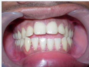
Figure 1d: Pre treatment intraoral-Frontal.

The maxillary arch was U-shaped with severely proclined maxillary incisors. The mandibular arch was also U-shaped with proclination and imbrication of mandibular incisors. Anterior open bite with forward tongue posture was observed. The maxillary and mandibular dental midlines and the skeletal midlines coincided with each other. On both sides the molar relation and canine relation was Class III (Figure 1d-1h).