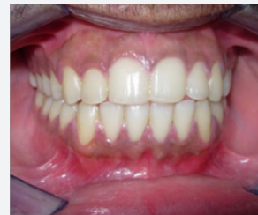
Figure 4d: Post treatment intraoral-Frontal.