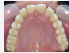
Figure 1g: Pre treatment intraoral-Upper Occlusal.