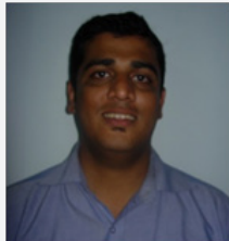
Figure 1c: Pre treatment extraoral-Smiling

The maxillary arch was U-shaped with severely proclined maxillary incisors. The mandibular arch was also U-shaped with proclination and imbrication of mandibular incisors. Anterior open bite with forward tongue posture was observed. The maxillary and mandibular dental midlines and the skeletal midlines coincided with each other. On both sides the molar relation and canine relation was Class III (Figure 1d-1h).