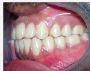
Figure 4f: Post treatment intraoral-Left.