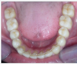
Figure 4h: Post treatment intra oral-Lower Occlusal