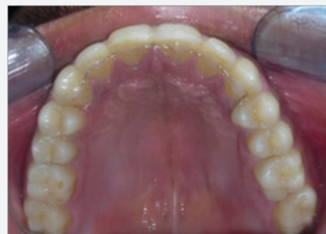
Figure 4g: Post treatment intraoral-Upper Occlusal