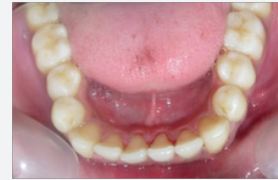
Figure 1h: Pre treatment intraoral-Lower Occlusal.

Radiographic assessment: The panoramic radiograph confirmed the presence of all permanent teeth with the exception of missing maxillary and mandibular third molars on the right side and horizontally impacted mandibular third molar on the left side with normal alveolar bone levels. Cephalometric analysis revealed a mild skeletal Class III pattern, with a nearly orthognathic maxilla and a mildly prognathic mandible, with a high mandibular plane angle and severely proclined maxillary and mandibular incisors.