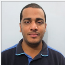
Figure 4a: Post treatment extra oral-Frontal.

The patient showed remarkable improvement in the correction of the anterior open bite achieved to a great extent by the low lying transpalatal arch which caused molar intrusion during every act of mastication and deglutition. The proclined maxillary incisors and the proclined and imbricated mandibular incisors were corrected and a class I canine relationship was achieved with the fixed appliance therapy. A pleasing soft tissue profile was achieved (Figure 4a-4h).