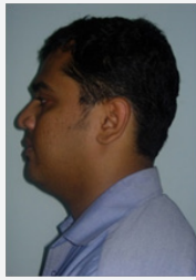
Figure 1b: Pre treatment extra oral-Profile.

divergence, incompetent lips, clinical high mandibular plane angle, with no signs of temporomandibular joint dysfunction (Figure 1a-1c). Intraoral assessment: Oral hygiene was satisfactory.