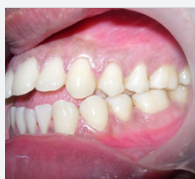
Figure 1f: Pre treatment intraoral-Left.