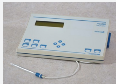
Figure 3: PHM 220 LAB pH meter.

next sample. The second phase of the test was the measurement of the pH of each solution. PHM220 LAB pH meter was used (Radiometer Analytical SAS, 72 rue d'Alsace, 69627 Villeurbanne Cedex, France) (Figure 3), which previously required using calibration with three buffers, first buffer pH value was 12.45 second was 1.67 and third one was 3, 00.