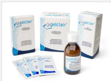
Figure 1: Gelclair artificial saliva (Helsinn Healthcare SA, Via Pian Scairolo 9, Pazzallo, Switzerland).

concentrated oral viscous gel with a special formula that helps in treating lesions of the oral mucosa (Figure 1). The gel creates a protective coat that is lying flat on the mucous membranes of the oropharyngeal cavity, thereby preventing further irritation and contributes to the rapid pain relief, healing lesions of the mouth, including those caused by drugs, disease, radiation, chemotherapy, oral surgery, traumatic ulcers caused by wearing orthodontic braces, dentures and aging.