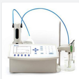
Figure 2: potentiometric titrator DL 70ES.

Testing was done on a potentiometric titrator DL 70ES (Mettler-Toledo GmbH, Sonnenbergstrasse 74, CH-Schwerzenbach), a device that is used to determine potential of individual ions on selective electrodes with an accuracy of three decimal places. The electrode was specifically selective for fluorides, which can get the exact value for each sample (Figure 2). Potentiometric titration is a volumetric method used to measure the potential between the two electrodes (referent and indicator electrode).