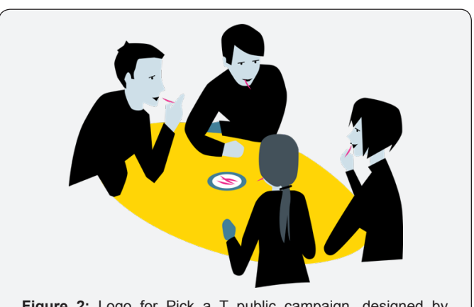
Figure 2: Logo for Pick a T public campaign, designed by Stephany Thijssen, a professional graphic designer.

To increase the awareness of oral health by promoting the use of toothpicks in context-related behaviour change circumstances, other than in regular dental services, a specific Pick a T logo was developed by a professional grafic designer (Figures 1 & 2).