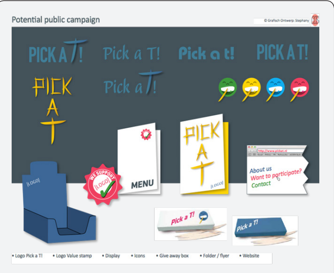
Figure 3: Moodboard with example applications for a Pick a T public campaign, designed by Stephany Thijssen.