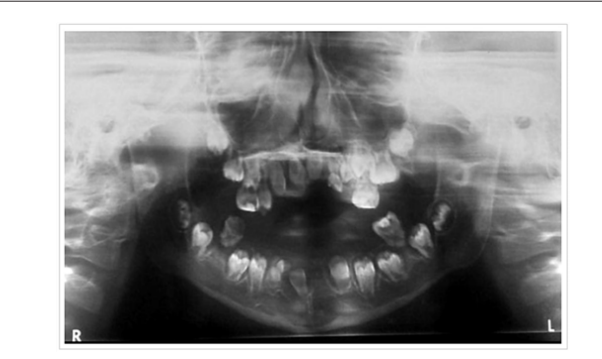
Figure 3: Panoramic radiograph revealed that the teeth had short and conical roots and obliteration of the pulp chamber.

Laboratory tests such as blood count, ionic calcium, phosphorus, serum iron, 17 alpha hydroxy progesterone, and rostenedione, alkaline phosphates total protein and fractions, A/G ratio, somatomedin and GH stimulation test after coniine did not detect any systemic disorders. Radiographs of hands and wrists showed images of bone development compatible with a 6-year-old child (Gilsanz-Ratib digital atlas for bone age estimations).