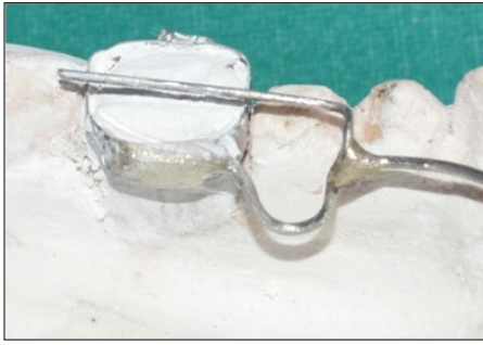
Figure 2a: Lateral View: Solder the lingual arch on the band and the occlusal component on lingual arch.