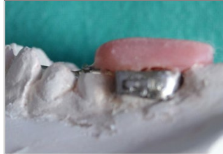
Figure 3b : Lateral View: Acrylic bite block on occlusal component.