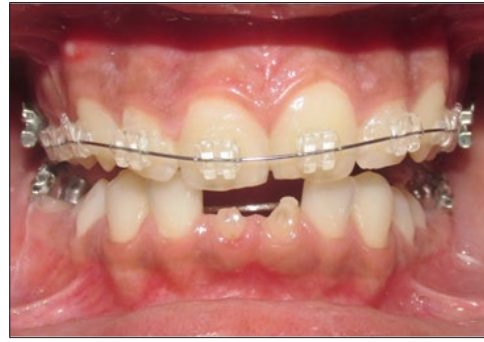
Figure 4b : With Bite Block.