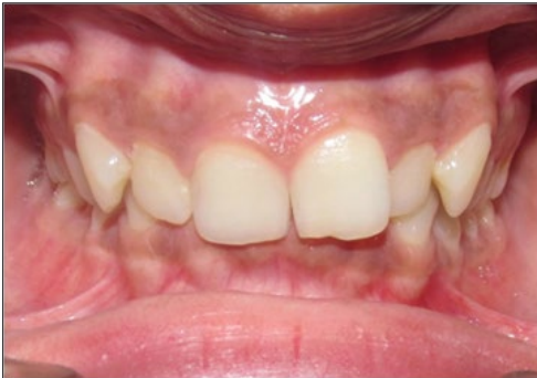
Figure 4a : Without Bite Block.