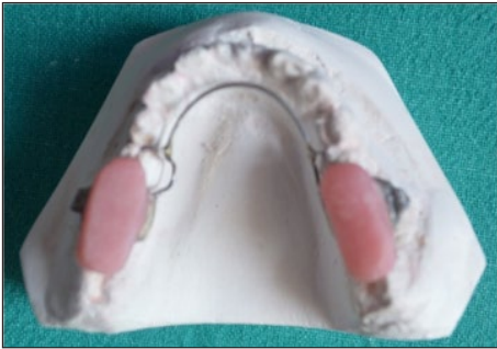
Figure 3a: Occlusal View: Solder the lingual arch on the band and the occlusal component on lingual arch.