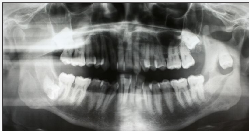
Figure 1: Panoramic view of ectopic third molar in the left sigmoid notch.