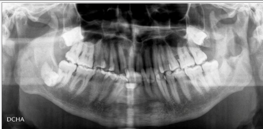
Figure 3 : Postsurgical panoramic view showing the beginning of healing in the surgical area.