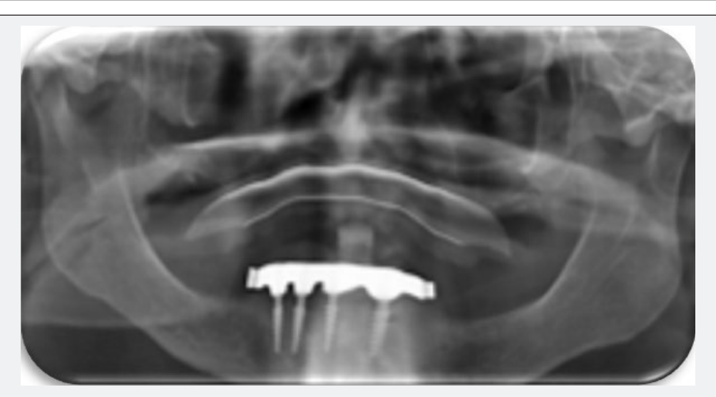
Figure 6: Post-operative panoramic radiograph.