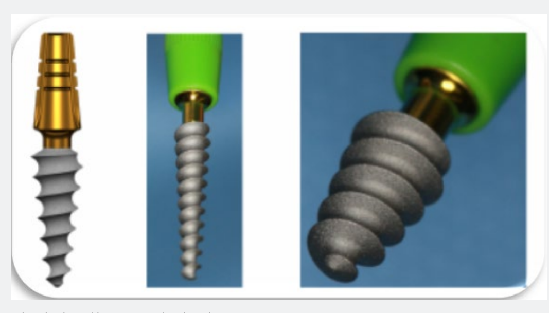
Figure 3: one-piece implant with a compression thread

one-piece implants of 3,5mm diameter and 14mm length were inserted flapless in positions 31, 32, 41 and 42 with a torque of 50N. One Piece implants (Figure 3) are machined in grade 23 titanium with a hydroxyapatite/beta tricalcium phosphate surface (HA/BTCP), the implant can be used to create single restorations in situations where high primary stability is achieved on placement.