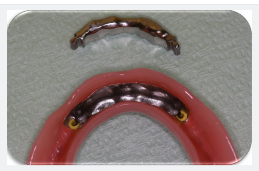
Figure 4: Bar-retained Overdenture Prosthesis.