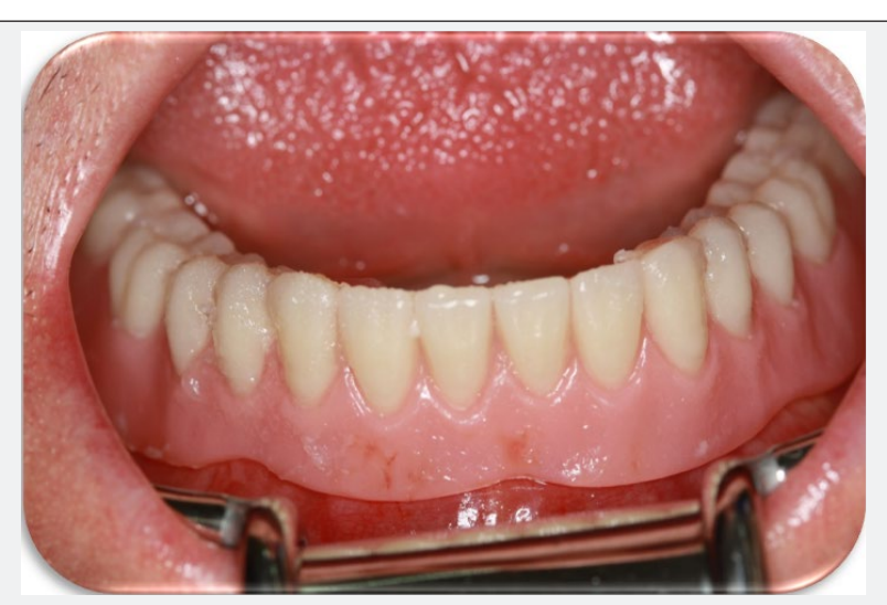
Figure 5: Overdenture Prosthesis intra-orally.