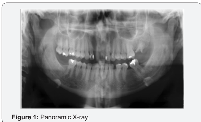
Figure 1: Panoramic X-ray.

Radiographically, there is a lobular radio lucid image of precise edges covering the maxillary anterosuperior area from the U.D. 1.2 and 2.2 horizontally extending to the floor of the nasal fossa in a vertical direction, in contact with apexes of the U.D. 2.3.