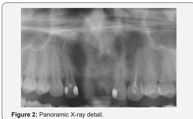
Figure 2: Panoramic X-ray detail.

In addition, it is observed radio lucid image that corresponds to Alveolus of the U.D. 2.1 in intimate contact with lesion mentioned above (Figure 1 & 2).