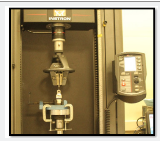
Figure 2: A Specimen loaded in the universal testing machine (Instron).