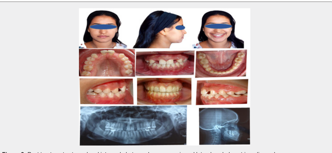
Figure 2: Post treatment extraoral and intraoral photographs, panoramic and lateral cephalometric radiography.