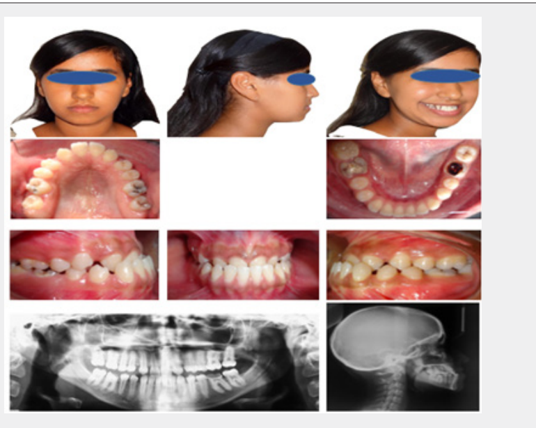
Figure 1: Pretreatment extraoral and intraoral photographs, panoramic and lateral cephalometric radiography.