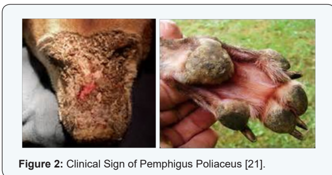
Figure 2: Clinical Sign of Pemphigus Poliaceus [21].

Pemphigus Foliaceus: It has no sex predilection but breed predisposition occurs. It is the most common form which may be either spontaneous or drug induced especially with trimethoprim-sulfas. Lesions consist of erythematous macules that progress rapidly to a pustular phase and then appear as a dry, yellow crust. These lesions may be limited to the pinnal, perioral, periocular, dorsal muzzle, nasal planum and/or nail bed regions or they may be generalized [6] (Figure 2).