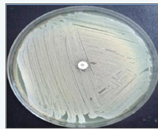
Figure 2: Antibiotic susceptibility test performed in Mueller Hinton agar, which clearly shows oxacillin resistant S. aureus (susceptible >13 mm).

from operative theater equipment's were analyzed. Irregular raised colonies observed in MacConkey agar were considered as a contaminant. Yellow colored colonies that have a positive reaction to the catalase and coagulase tests were identified as gram positive cocci, consistent with S. aureus . These isolates of S. aureus were further confirmed as methicillin resistant S. aureus (MRSA) by showing resistance to the antibiotic oxacillin 1µg, [susceptible >13 mm] (Figure 2). The resistant samples were identified and labeled as methicillin resistance S. aureus (MRSA). Coagulase positive S. aureus were isolated from 104 3.28% (Figure 3). The findings coincide with the study done by Koichi et al. [17].