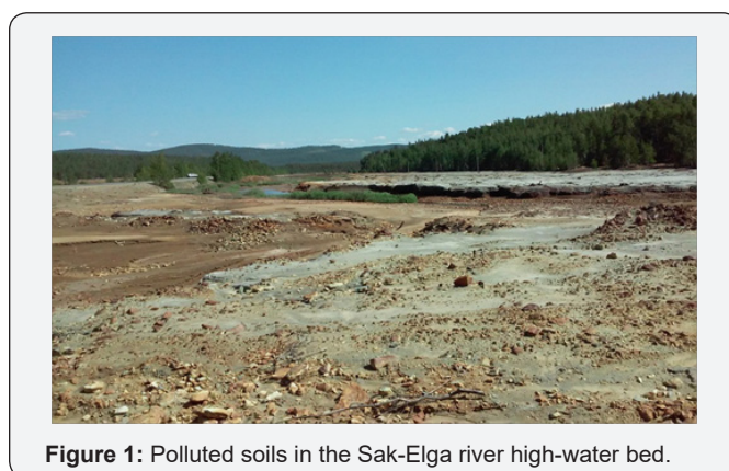
Figure 1: Polluted soils in the Sak-Elga river high-water bed.

The perfect sorption material for recovering large natural objects should not involve preliminary and periodical chemical preparation of the soil surface and should be environmentally friendly upon retiring. Heavy metal cations absorbed by the material should not be able to return to nature, water or soil. The aim of our research is to study the efficiency of using synthesized inorganic sorbent for soil recovery in the most polluted industrial area of the Chelyabinsk region - the city of Karabash (Figure 1&2).