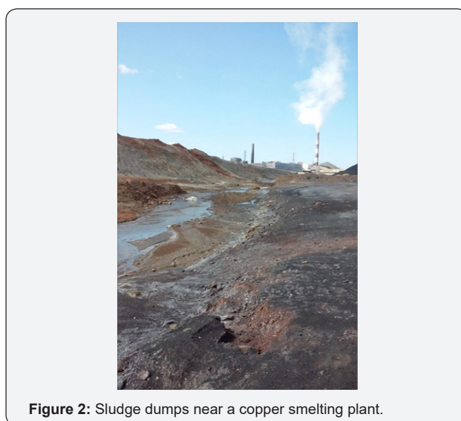
Figure 2: Sludge dumps near a copper smelting plant.

In June 2016 representative soil samples were taken from the Karabash sludge dumps. Our research methods involved