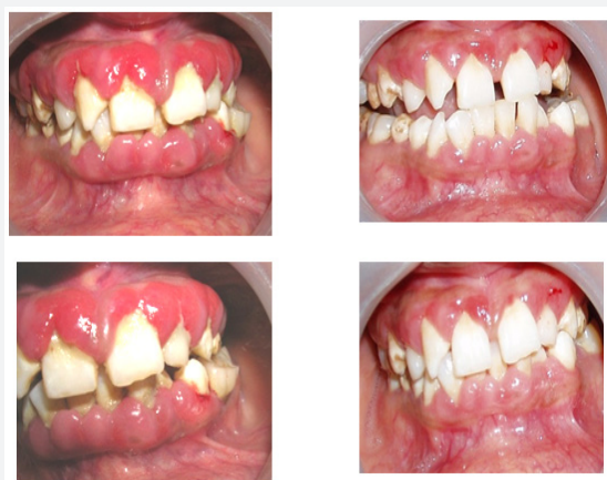
Figure 2: Photographs showing the effects of treatment during the clinical study.