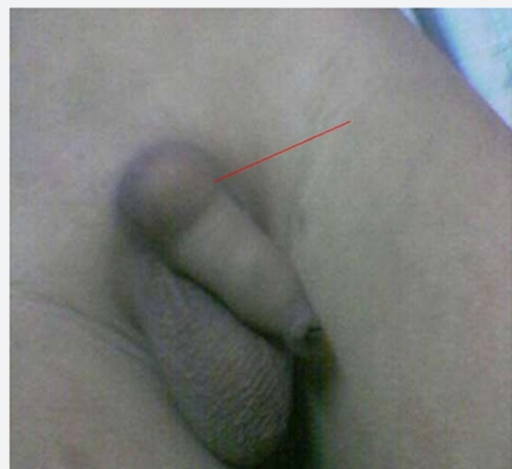
Figure 1: Pubopenile ectopic testis.

with a swelling, and normal secondary sexual characteristics. His general and systemic examination was normal. On local examination right testis was normally placed in the scrotum and it was normal in size and shape. Left side of the scrotum was empty with hypoplastic scrotal sac and normally developed external genitalia. There was a single, well defined, mobile, oval shaped swelling of size 3 X 2 X 2 cm, palpable at the base of the penis (Figure 1).