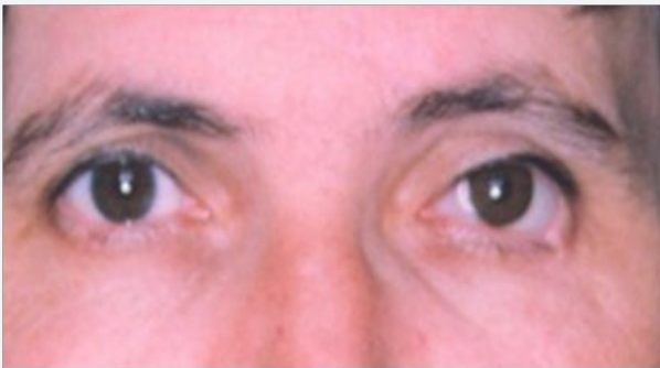
Figure 5: Final clinical aspect with the epithesis in position.

The prosthesis was placed in the eye cavity and the patient was asked to perform eye movements in all directions and various facial movements. The opening of the palpebral fissure was verified (Figure 5). The patient was also informed about how to insert, use and clean the eye prosthesis. The evolution of the case was favorable both regarding the adaptation of the patient to the eye epithesis and aesthetic appearance.