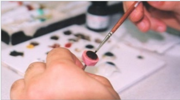
Figure 3: Painting of the iris.

The discs for painting the iris were chosen based on the data of the patient's record. The color of the healthy eye was brown with greenish hues. The first disc was made from a brown plate, 0.2mm larger compared to the iris diameter (11.9mm), which was covered with white thermally polymerized acrylic resin, for a smooth transition between the two colors. A support was attached to the first disc, which facilitated handling during painting. The second disc, made of transparent acrylic resin, had a black round spot in the middle, 3.5mm in diameter, corresponding to the pupil. During the iris painting session, the patient's presence was necessary, and this stage was carried out under natural lighting conditions. First, the background (the basic color) was made, which was brown, obtained from black + orange + brown (Figure 3).