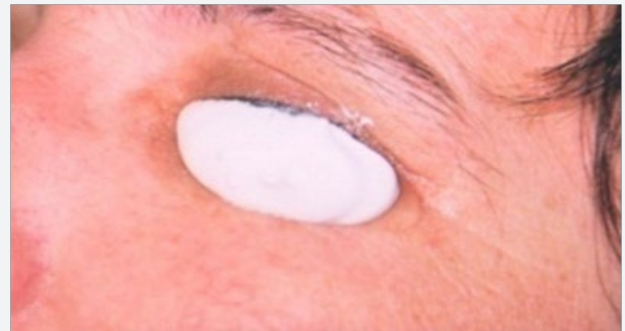
Figure 2: Impression stage.

The patient was in dorsal decubitus, for an easy and correct handling of the impression material. The impression tray was chosen depending on the degree of lack of substance. The soft tissues were cleaned with a gauze pad and their status was assessed: on the outside, the eyelids had a normal appearance, without essential changes in volume or shape; the inferior and superior fornices were favorable for prosthetic restoration; the mucosa had no ulcerations, and cicatrization was adequate. By correlating anamnestic data with objective examination data, it was found that this patient had a medium size defect. The surrounding tissues were isolated with petroleum ointment. The impression material was prepared (CA 37 FAST SET was used) according to the user's instructions: one measure of fast setting alginate and one measure (special graduated cup) of water.