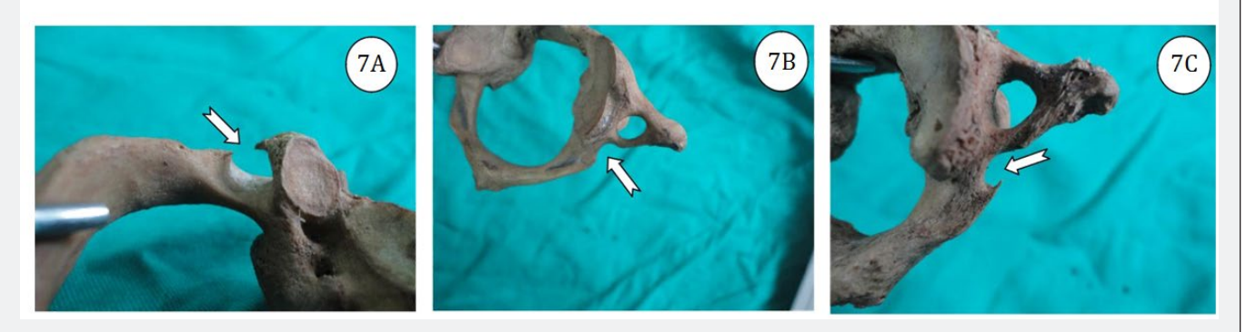
Figure 7: Superior view of Atlas vertebrae showing incomplete accessory FT (arrows) with different shape (7A) semicircular (7B) hemi circular (7C) U shape.