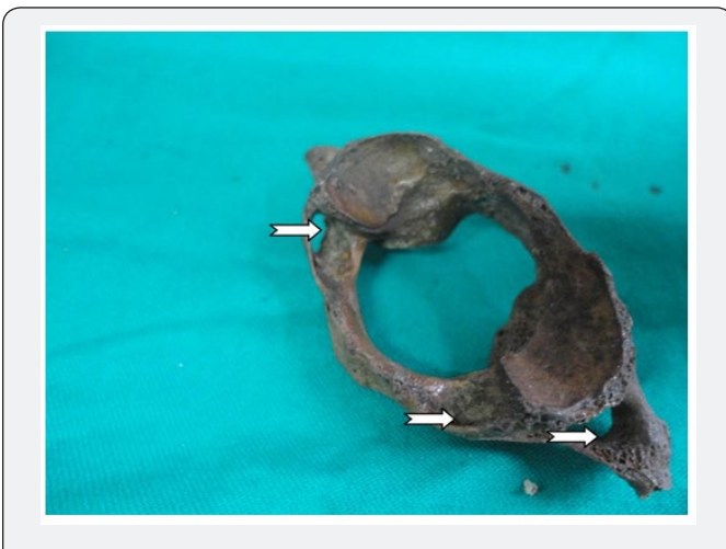
Figure 4: Superior view of Atlas vertebrae showing bilateral double FT (arrows) located on the posterior arch.

Figure 3: Superior view of Atlas vertebrae showing unilateral double FT (arrow) on the root of the transverse process