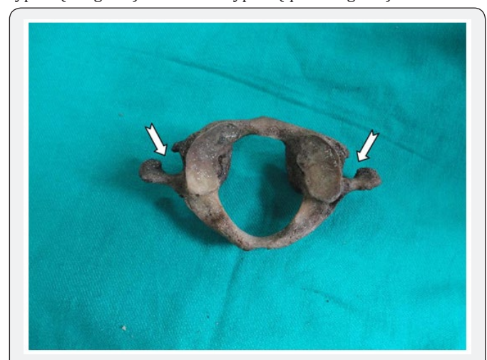
Figure 5: superior view of Atlas vertebrae showing bilateral incomplete FT (arrows) indicating absence of costal element of both transverse process of atlas vertebra..

both sides. The accessary foramina were present on the posterior root of the transverse process in 10 cases while in 13 cases the foramina were observed at the posterior arch (Figure 3-5). Some accessory foramina were too small. Incomplete foramina were observed in 9 vertebrae (6.9%), 4 on right 3 on left 2 bilateral (Figure 6). Also, in 6 vertebrae (4.6%) incomplete accessory foramina were observed with different shape semicircular, hemi circular and U shape in Figure 7 with 2 on the left 3 on right 1 bilateral (Table 1). Study of the shape of the foramina transversaria based on the anteroposterior and mediolateral measurements showed four different shapes; type 1 (rounded) was predominant 54.1%, type 2 (oval) less prominent 29.6%, type 3 (irregular) 10.4% and type 4 (quadrangular) 5.8%.