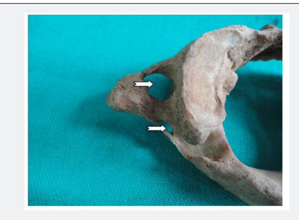
Figure 3: Superior view of Atlas vertebrae showing unilateral double FT (arrow) on the root of the transverse process