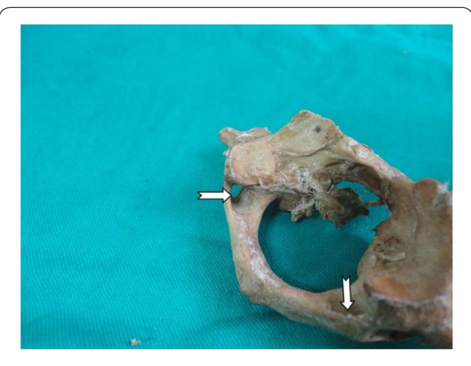
Figure 6: Superior view of Atlas vertebrae showing bilateral double FT(arrows) located on the posterior arch.

Table 1: Percentage of occurrence of complete, incomplete, doubled and absent foramen transversaria of atlas vertebrae.