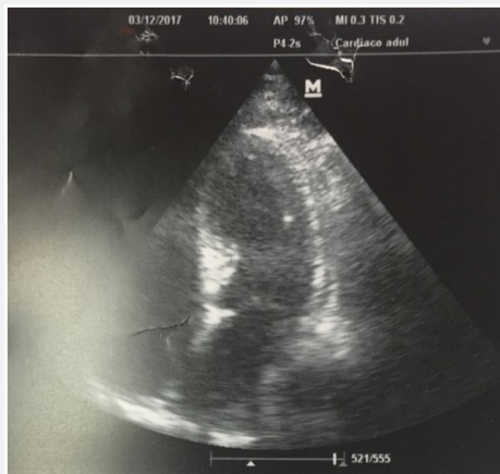
Figure 2: An echocardiogram performed revealed systolic dysfunction with any regional wall motion abnormalities and lateral pericardial effusion.

and almost completely normalized within ten days. Despite the atypical nature of our patient's presentation, including cardiac involvement, we believe that his intense inflammatory response may be attributed to his recent vaccine in the absence of other causes, especially given the timing of adjuvant exposure. Based on the patient's clinical and laboratory findings, a presumptive diagnosis of ASIA was made. The patient recovered fully, and was safely discharged home on day fifteen.