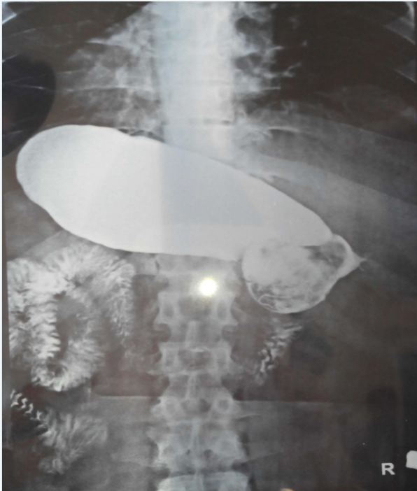
Figure 1: Barium swallow revealing mass like lesion at Antro-duodenal area.

then removed with gentle round motions from the mouth. The prolonged sticking of surgical sponge lead to huge dilatation of pyloric antrum (Figure 4). The removed surgical sponge was 26 cm x 23 cm and is of the largest size which has been successfully removed endoscopically, till date (Figure 5). The procedure was completed without any complications .The next day; all laboratory parameters, check endoscopy and abdominal ultrasonogram were found to be normal. The patient was started on per- oral feeds which he accepted well, hence was discharged under hemodynamically normal condition after two days of observation.