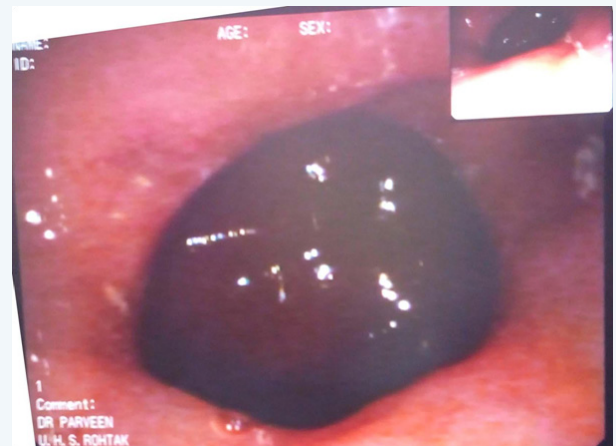
Figure 4: Dilated Pyloric Antrum after removal stucked Gossypiboma.