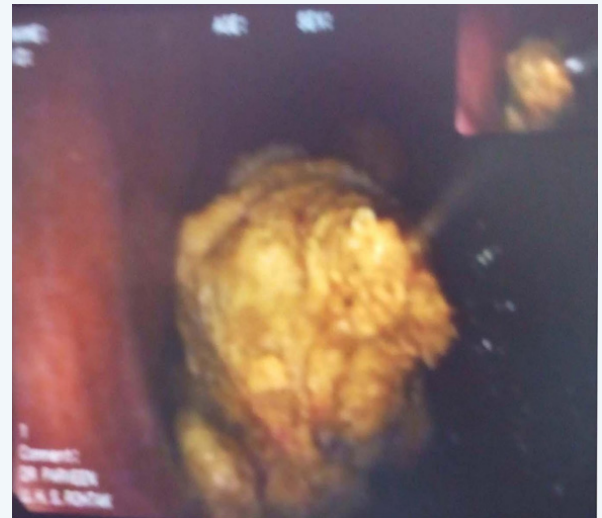
Figure 3: Gossypiboma being removed with help of Snare.