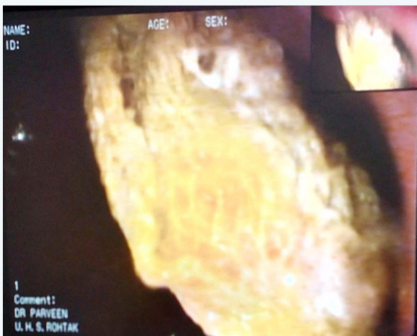
Figure 2: Large Gossypiboma which migrated into stomach.