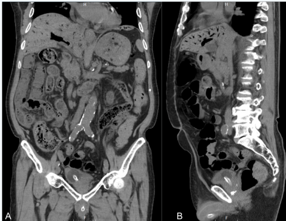
Figure 2: Non-contrast CT of the abdomen and pelvis on admission.

B. Axial view of the intestines demonstrating feces and air-fluid levels in the small bowel and gas within the large bowel wall without evidence of bowel necrosis.