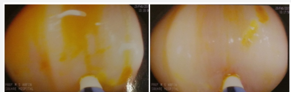
Figure 2: Argon plasma coagulation (APC).

Angiographic intervention is also not preferable as there is a possibility of existence of multiple unnoticed angiodysplasias, possibility of gut infarction after angiography, and the deranged renal function of the patient would be a contraindication for angiography. All these problems make it difficult to choose the best and acceptable solution for this patient like aortic valve replacement (Figure 2&3).