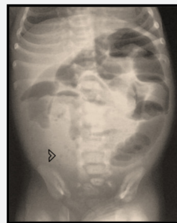
Figure 1a: Dilated small bowel loops and paucity of bowel gas in the central and right lower quadrant (arrow head).

peripheral hospital post caesarean section delivery, so formula feeds (Lactodex) were started from the second postoperative day. On the fourth postoperative day the child developed intolerance to feeds with bilious vomiting, abdominal distension and constipation. Preoperatively the child had passed meconium on day one of life and had normal stool habits. A radiograph showed dilated small bowel loops and paucity of bowel gas in the central and right lower quadrant (Figure 1a & 1b).