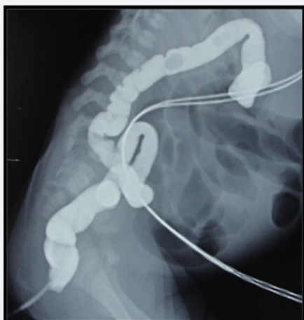
Figure 1b: A narrow caliber colon loaded with pellets.

A diagnosis of neonatal intestinal obstruction was made and the child was managed conservatively for 24 hours. NEC was unlikely as the baby was full term, appropriate for gestational age and the sepsis screen was negative. A contrast enema ruled out atresia but it showed a microcolon loaded with pellets. Since the child did not decompress with repeated attempts of enema and had progressively increasing abdominal distension, emergency exploratory laparotomy was planned.