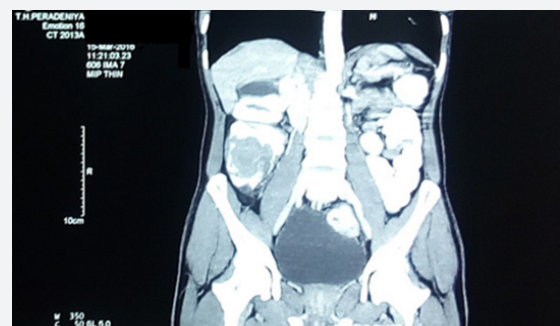
Figure 2: CT image showing mass lesion in the caecum.