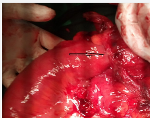
Figure 3: Intraoperative findings. Inflamed distal ileum, caecum and large mesenteric lymph node mass in the ileocolic region. Telescoping of the distal ileum into the caecum was also evident (arrow).

Taking into account the mass lesion seen on CT and Colonoscopy, a Laparoscopy assisted right Hemicolectomy was performed. Intraoperatively an ileocolic intussusception was evident with distal ileal segment telescoping into the caecum (Figure 3). There was an associated enlarged mesenteric lymph node mass. Distal ileum, caecum, ascending colon and proximal transverse colon was resected with adjacent mesentery to include the lymph node mass. End to end ileo-colic anastomosis was performed. Post-operative period was uneventful. Patient was discharged home on 5th postoperative day.