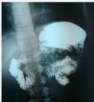
Figure 1: Double contrast X-ray. Distended stomach with pseudo diverticulum in the pyloric region.

tomography of the abdomen revealed the presence of annular pancreas, separated inferior part of the spleen and confirmed the diagnosis of gallbladder and duodenal duplication. Magnetic resonance cholangiography (MRCP) was made to establish the type of gallbladder duplication and to demonstrate the presentation of bile and pancreatic ducts. Because of small caliber of the cystic ducts and their openings exact determination of the type of gallbladder duplication was not possible. The evaluation of MRCP was also difficult because of abnormal anatomic presentation of the pancreas and duodenum. Since the child still suffered from abdominal pain and vomiting preparations for surgery were made. To preoperatively well establish the anatomic presentation of the gastrointestinal malformation endoscopic retrograde cholangiopancreatography (ERCP) was performed. Catheterization of one of the duodenal papillas, localized on the edge of the wide open pylorus, showed short pancreatic duct with small pancreas. Catheterization of another duodenal papilla, localized in duodenum showed two gallbladders, laying side by side. The bile outflow from both of them was good (Figure 1).