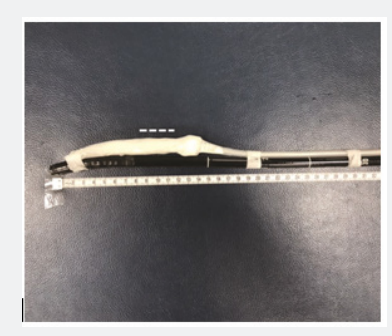
Figure 1: An introduction kit is attached to the endoscope at 2 cm, 20 cm, 30 cm from the end of the endoscope. The window side is marked with dotted line.

i. A 3.5 \, \mathrm{cm} \, \mathrm{X1cm} sized window was made at the distal part of the pouch for releasing a balloon before side attachment to an endoscope.