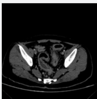
Figure 5: CT demonstrating the thickening of the colon.

The CT presented diffuse parietal thickening of the descending and sigmoid colon, with engorgement of the pericolic vessels and densification of the regional adipose planes, associated with lymph node enlargement up to 1,2cm on the largest axis (Figure 5).