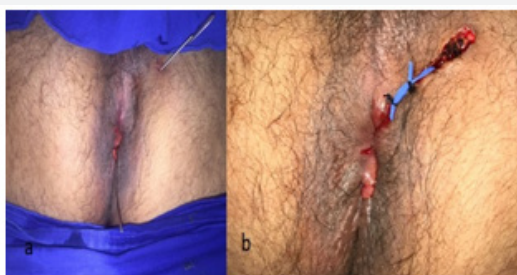
Figure 6a & 6b: Trans-sphincteric fistula tract and drain placing in the fistula.

Intravenous infusion of immunoglobulin (1x/monthly) and subcutaneous adalimumab (14/14 days) were prescribed, after the recommended induction doses of the anti-TNF agent (160mg in week 0, 80mg in the week 2 and 40 mg in the week 4), and the surgical treatment of the fistula tract was done with drain placing (Figure 6a & b) and biopsy of the tract.