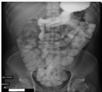
Figure 4: Normal intestinal transit.

The intestinal transit evidenced stomach, duodenum, jejunum, ileum with normal distribution (Figure 4).