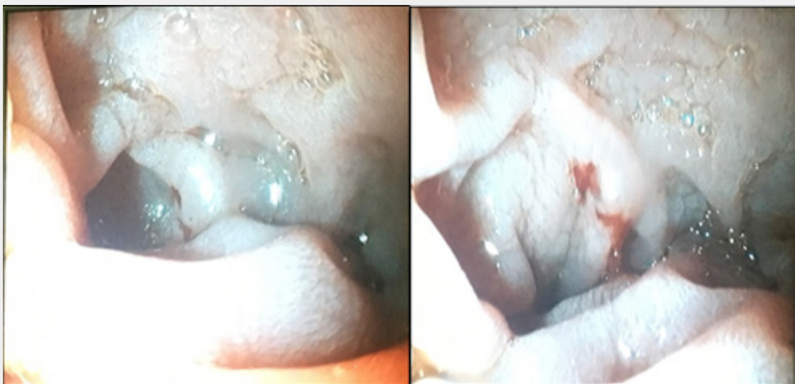
Figure 1: Endoscopic view of duodenal mucosa and bleeding after biopsy.