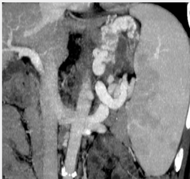
Figure 2: CT venography (CTV) of the portal venous system: A. IGTV was confirmed on abdominal CT before the procedure. B. Significant regression of the gastric varices after E-BRTO therapy, as seen in post-procedure CT.