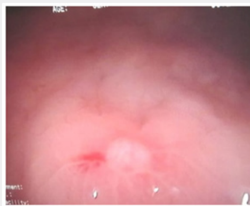
Figure 1: Showing Apthae in Rectum.

Our case report is of a eighteen year old young male, admitted with probable diagnosis of acute appendicitis & later on suspected to be having tubercular abdomen but on investigations was diagnosed with Whipple's disease. The early diagnosis leading to urgent and proper treatment based on scientific rationale proves to be game changer in this rare and treatable disease (Figures 1-3). Whipple's disease is usually seen in middle-aged males, involved in land & dairy farming and presents with prodromal findings of fever, fatigue, and joint disorders [4]. The Classical Whipple's disease is characterized by a tetrad of symptoms: arthralgia, weight loss, diarrhea, and abdominal pain. In classical Whipple's disease, prodromal symptoms are generally followed by abdominal pain, nausea, chronic/intermittent diarrhea, and severe weight loss due to malabsorption. Gastrointestinal findings are the most common clinical manifestations in about 90–95% of the patients [5].