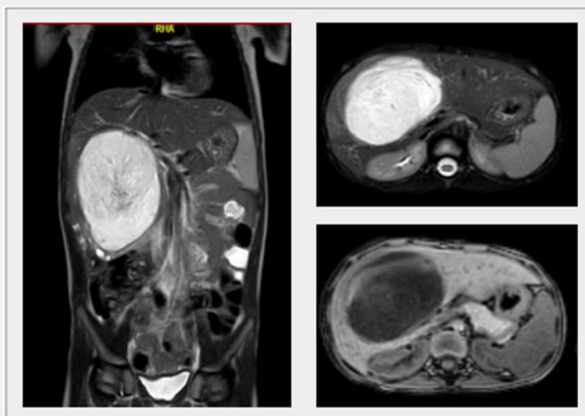
Figure 1: MRI, sagittal and axial section with a predominantly cystic unifocal liver mass, with enhancement after contrast, involving segments V and VIII, generating compression and displacement of vascular structures without invasion. With diameters of 94 x 76 x 77 mm.

A 4-year-old male patient, previously healthy and with no significant family history. He was admitted to a primary care hospital for two weeks of fever and abdominal pain. In the evaluation with finding of hepatomegaly 5 cm below the right costal margin without other alterations. US with report of enlarged liver due to heterogeneous mass in segment V and VI, so he was referred to a hospital of higher complexity. Laboratory studies revealed no signs of cholestasis, and the serum AFP level was negative. MRI (Figure 1) was performed with evidence of predominantly cystic unifocal hepatic mass and posterior wall enhancement with contrast administration, involving the segments V and VIII, generating compression and displacement of the vascular structures (hepatic venous and portal system), but without invasion. Also, slight compression and displacement of the gallbladder and the bile duct without dilation. No extrahepatic disease, free fluid, or lymphadenopathy. A hamartoma is considered the first diagnostic possibility.