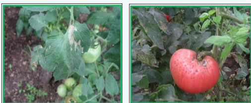
Figure 1: Tuta absoluta damage on tomato leaves and fruit.