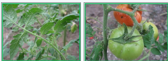
Figure 3: Trialeurodes vaporariorum population on tomato leaves and fruits.