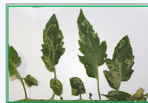
Figure 2: Liriomyza sp. damage on tomato leaves.