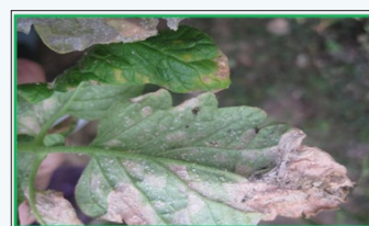
Figure 4: T.absoluta and T. vaporariorum simultaneous damage on tomato leaves.

Among them the fern scale, Pinnaspis aspidistrae Sign. (Figure 6) damages - the sword fern - Nephrolepis exaltata , the dragon-tree - Draecena draco , the smilaxes - Smilax exelsa .