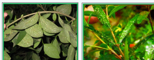
Figure 5: T. vaporariorum on Ligustrum vulgare (1) and - Punicea granatum (2).