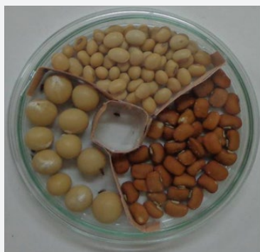
Figure 1: Experimental device for assessment of female oviposition host preference in free choice situation

choice experiment: The experiments were conducted under laboratory conditions ( t = 23.71-25.00 °C, hr = 73.41-75.72\% ). Five pairs of freshly emerged adults of C. maculatus were introduced in each replication comprising of 50 grams sample placed in a glass jar covered with muslin cloth and perforated covers. Weevils were allowed to mate and oviposit till the death of females. Thereafter, each grain was examined separately with a magnifying glass and the number of eggs laid was counted for each replication.