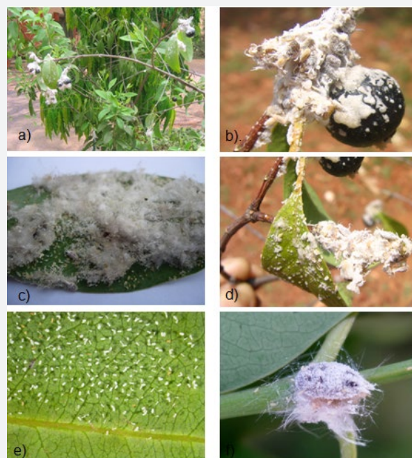
Figure 1: a) Ferrisia virgata infestation on sandalwood plant B) Sandal wood fruit c) Sandalwood leaf d) Sandalwood stem e) Eggs and nymphs of Ferrisia virgata f) Matured Ferrisia virgata female.