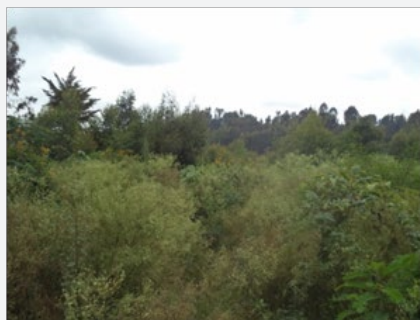
Figure 2: P. hysterophorus infestation at Sire, Sire Woreda on forest field, Eastern Wallaga.