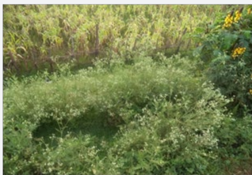
Figure 1: P. hysterophorus infestation at Najjo adjacent to crop field, Western Wallaga

Data Analysis: All data is summarized using excel Microsoft office 2010 for better description and illustrations.