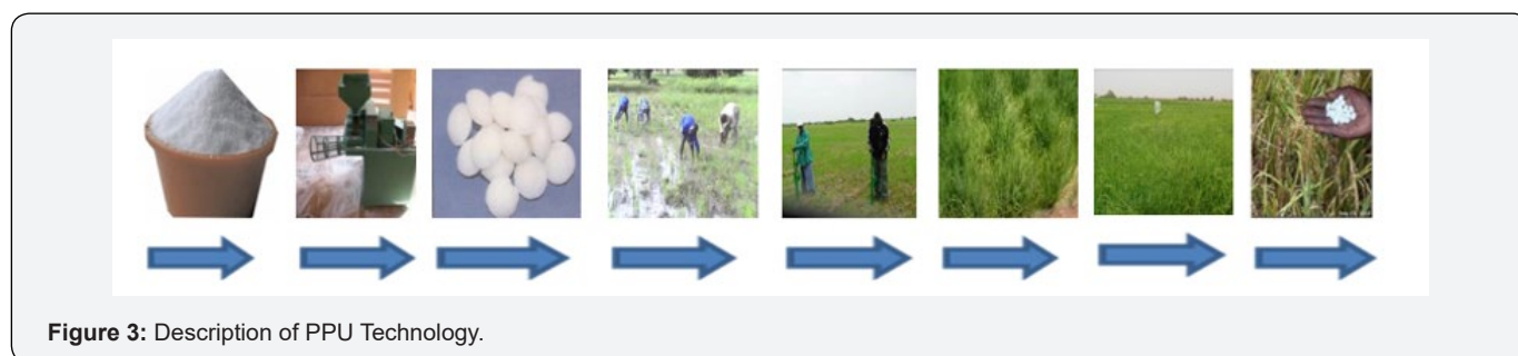
Figure 3: Description of PPU Technology.