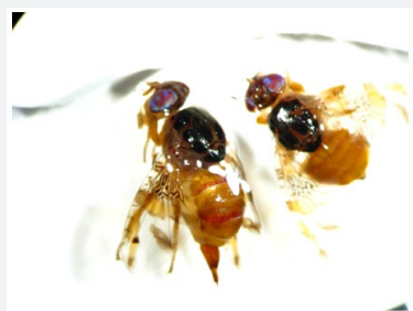
Figure 1: Ceratitis capitata (Photo taken by the author of the article in the laboratory).

The primary population of the fresh fruit flies was made up of four pairs of adult insects from a laboratory belonging to the department of plant protection, PFUR in Russia (Figure 1). In this lab, the population was raised for five generations on an artificial diet (a diet based on wheat bran for larvae and a diet based on hydrolyzed protein for full insects).