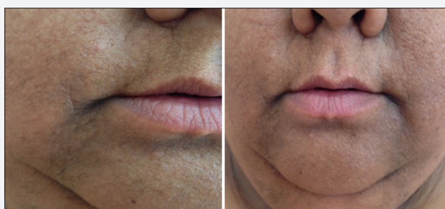
Figure 1: Anterior view of the lip corners.