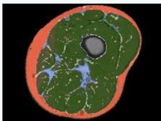
Figure 2: Representation of muscle bundle volume painted in green and subcutaneous adipose tissue in red.