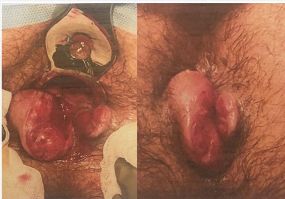
Figure 1: Physical examination revealed an exophytic tumor at the perianal skin level, predominantly right lateral, ulcerating skin of 6x4 cm, infiltrating the anal canal, without adenopathies at the inguinal level.

the inguinal level (Figure 1). A biopsy of the anal and rectal tumor was performed, which reported a neoplastic lesion below the lining epithelium, confirmed by a proliferation of medium-sized ovoid cells, showing central ovoid nuclei, with regular contours, moderate pleomorphism with open chromatin and very evident eosinophilic nucleoli. Scanty, eosinophilic cytoplasm, arranged in a solid, infiltrative histologic pattern. Numerous atypical mitoses with immunohistochemistry: HMB45: positive in malignant neoplastic cells; PS100: positive in malignant neoplastic cells; HHV-8: negative; CD34. Cytokeratins AE3/AE6, CK5/6, P40, Chromogranin and CD45: negative, with definitive histopathological diagnosis: by morphology and with support of immunohistochemical markers compatible with nodular melanoma. To stage the melanoma, a PET/CT study was requested which reported a hypermetabolic anal lesion highly suggestive of tumor activity, pelvic adenopathies, bone and lung lesions probably as secondary deposits (Figure 2).