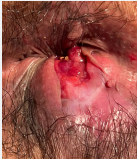
Figure 3: The conservative treatment with immunotherapy with favorable results at 3 months, with significant reduction of the tumor and absence of bleeding.