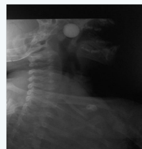
Figure 1: X-ray head, neck and chest lateral view shows radio-opaque spherical foreign body in nasopharynx.

and nasal examination was free, X-ray head, neck and chest post anterior view and lateral view was requested. X-ray head, neck and chest lateral view shows a radio-opaque spherical foreign body impacted in the nasopharynx (Figure 1).