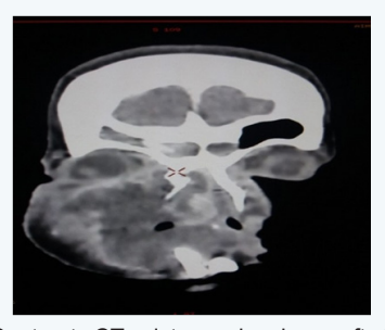
Figure 2: Contrast CT picture showing soft tissue mass involving the maxillary sinuses with destruction of hard palate and extension into the oral cavity.

nasal cavity causing destruction of walls of maxillary sinuses, perforation of hard palate with extension into the oral cavity and also extending to the right orbit (Figure 2).