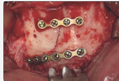
Figure 1: Intraoperative clinical photograph showing reduction and fixation utilizing 6 holed 2.0 titanium miniplate and 4-holed low profile titanium miniplate placed superiorly as a tension band and fixed with 4 monocortical 1.5 mm screw of 5 mm length.

c.Fracture reduction and Fixation: Once the fractured segments had been reduced to the normal anatomical position, fixation was performed according to Champy's ideal line of osteosynthesis. A titanium miniplate (6-holes) was contoured and adapted to the labial aspect of the mandible and fixed at the inferior border of the mandible along lower Champy's line with 6 bicortical 2.0 mm screws after drilling under copious saline irrigation to prevent thermal bone injury. In group I, a low profile titanium miniplate (4-holes) was adapted superiorly as a tension band and fixed at the upper Champy's line with 4 monocortical 1.5 mm screws after drilling under copious irrigation (Figure 1). In group II, a titanium miniplate (4-holes) was adapted superiorly as a tension band and fixed at the upper Champy's line with 4 monocortical 2.0 mm screws after drilling under copious irrigation.