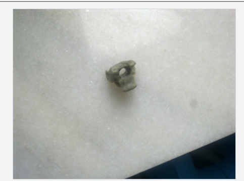
Figure 2: Foreign body-chicken neck vertebra.

At repeted follow up the evolution of the child was normal good with good general status, good, normal breathing ,no rinoreea ,no deafness-immitance audiometry return to type A normal, normal aspect of the eardrum. The child was than sustained with vitamins and general polivaccine, so the recurrent infections stoped he gain in weight and heights (Figures 1 & 2).