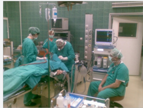
Figure 6: Stiffening uvulopalatoplasty and glossoptasty assisted RF. Operation without cut and sutures with combination of intervention on palate and base of the tongue, results are even better. When in comply with diagnostic-surgical protocol, which understands marking of the obstruction place and then its surgical extension, success could not escape.

Interventions on the base of the tongue, hyoid bone and muscle of throat dilators are intended for solving of retro lingual obstruction [13]. If the place of occlusion is base of tongue, success of intervention covers approximately 70% of cases (Figure 6). Operations of uvulopalatopharyngoplastic type last approximately 40 minutes. During the intervention, tonsils, uvula, part of free pair of soft palate and forward arch are eliminated. Back palate arches are reduced. Orofaringeal air way is widened. During the intervention, radio-wave laser of 4.0 MHz is in use, helping precise, solid and almost bloodless work. Velopfaringeal insufficiency and pfaringeal stenosis are the most frequent complications that arise during intervention, and request additional treatment [13,14]. During several days after surgical intervention, pain, infection, changes in tone of voice, and hard engulf can arise. Bleeding that could be premature or in later phase of intervention could cause complications.