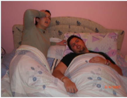
Figure 1: Terror for ears, Men that snore do not hear themselves, but snore irritates the person close to them. Chronic snores and those with apnea problems spend little time in deep sleep that is essential for good rest, so that daily dizziness appears to be one of the leading symptoms.