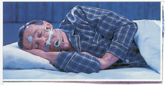
Figure 4: Patient prepared for polysomnography.

During such examinations some parameters can be found and among them degree of oxygenation, longitude and number of breath brakes, oscillations of heart and blood pressure, clamor intensity, stand as the most important. To find the narrowest airway, technique (APNEA GRAPH) is used, and it gives us information on time, occlusion level and scale. Depending on the results, patients for surgical and non-surgical treatment are chosen. Even through a clinical examination in respectable cases the cause for above-mentioned problems can be detected. Namely, by healthy persons distal end of soft palate and ovulate lays above horizontal plane of tongue, that is not the case by loud snores. Using faringoscopy in some cases, immediately after sleep, some cyanotic and bloated deformations on uvula can be seen, as signs of abundant night activity. Beginning of examination must always start from the nose. When the case is about bone deformations and abnormalities, cefalometric analyses can be of help.