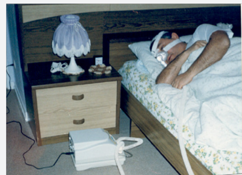
Figure 5: Patient using CPAP device that brings air in lungs under pressure. In treatment of apnea it represents a "golden standard".

To relieve from the unpleasant feature, some measures of self-help can be of use. In the case of milder snores and temporary appearance of rhonchopathy, first, reduction of weight, avoidance of abundant evening meals and drinks, drugs and sedatives, as well as evening walks, sleeping on side with a highly positioned pillow etc., can bring to prosperous results. In the case of loud snores in every position of the body, even on stomach, treatment needs some gadgets and instruments, or a surgical intervention. Dental stretch