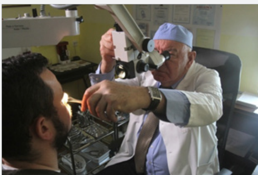
Figure 3: Every case of loud snoring must pass through detailed clinical examination.

(Figure 3) In evaluation of the patients condition, diagnosis requests the use of Polysomnography as the "golden standard". This examination can be done in the Department for Breath Problems during sleep, in Sremska Kamenica, led by Dr Kopitovic (Figure 4).