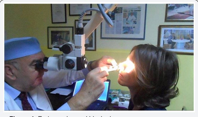
Figure 4: Endonasal neural blockade.

A less invasive option in the treatment of a headache of the contact point involves the use of neural blockages. Usually a local anesthetic in the form of lidocaine or xylocain is combined with corticosteroids and is applied approximately 5 mm above the center of the central nose in the mucous membrane of the nasal side wall. The results were variable, but more than 50% of patients experienced significant relief after the second dose [17]. In our statistics in over 55% of cases, patients were satisfied with this treatment.