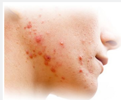
Figure 1: Clinical image of infected sagging skin.

In a series of clinical studies, 34 women (ages 35 – 71), who presented visual signs of aging (like saggy skin on their necks and faces, swollen nose and crow's feet wrinkles), applied a cream containing 2% Majestem (the same amount in Ageless Glow) twice daily on their faces and necks for 6 weeks. After just 3 weeks, the researchers found that sagging skin on the women's neck significantly tightened, sculpting and restoring a youthful neck line [1]. After 6 weeks, they found that the women's cheeks had been lifted and their tear troughs (i.e., “eye bags”) had been reduced (Figures 1-4).