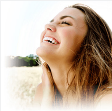
Figure 2: Majestem-It lifts sagging skin.